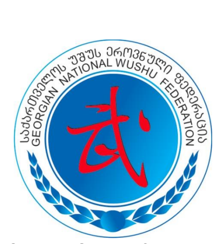
GEORGIAN NATIONAL WUSHU FEDERATION Batumi Open International Wushu Tournament Regulations 06-11 September.